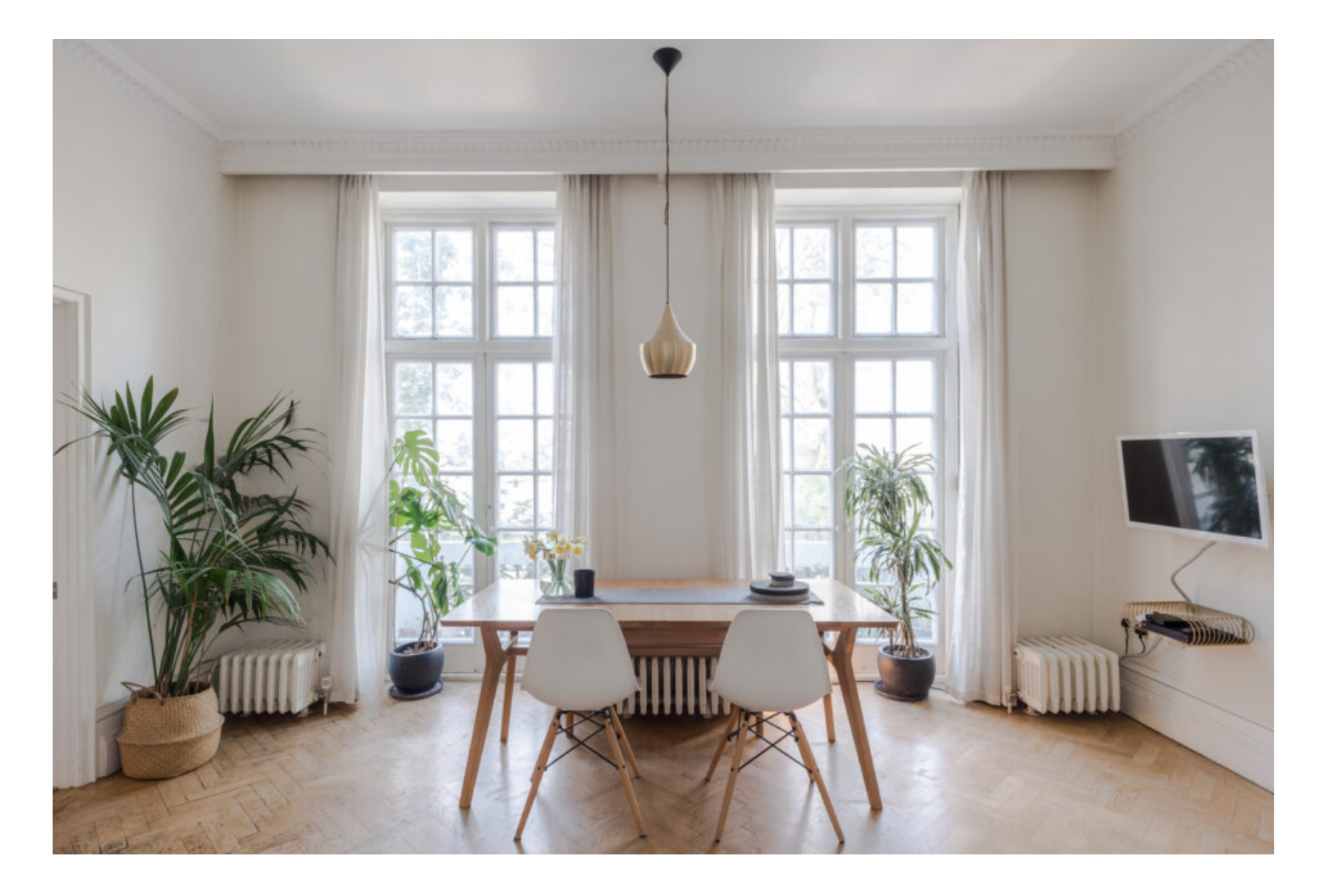
Sydenham Hill, London SE26 £550,000 Leasehold