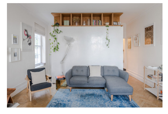
London, South London £550,000 Leasehold