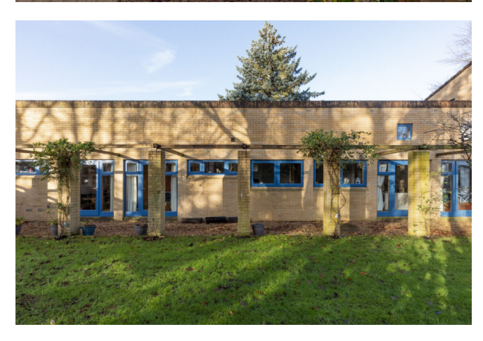
South-East England Sold