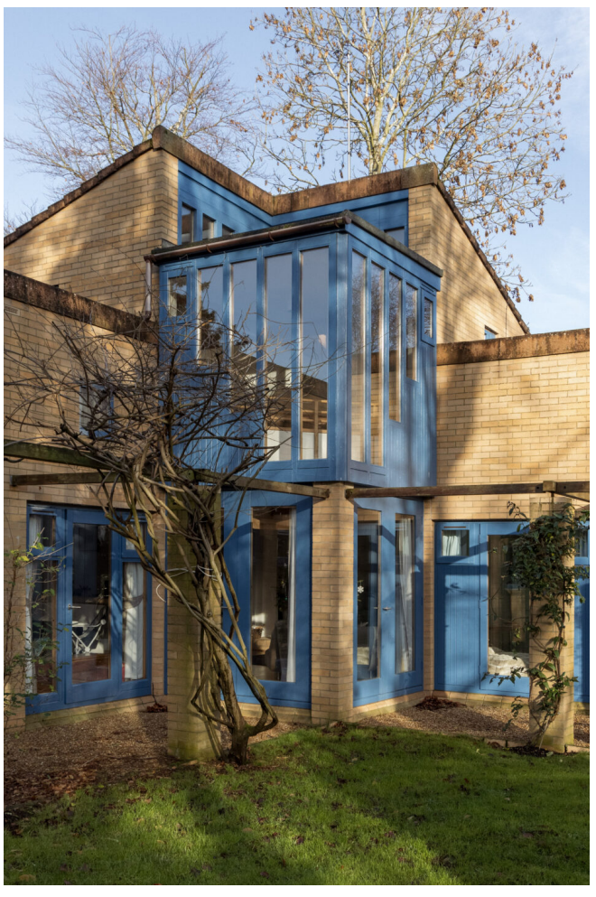
South-East England Sold