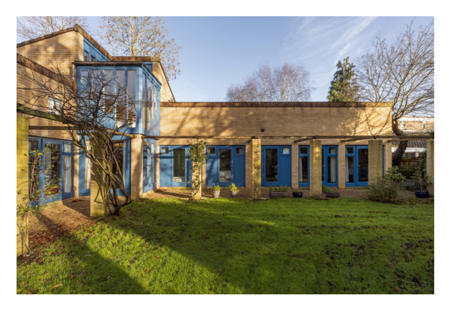
Huntingdon Road, Cambridge