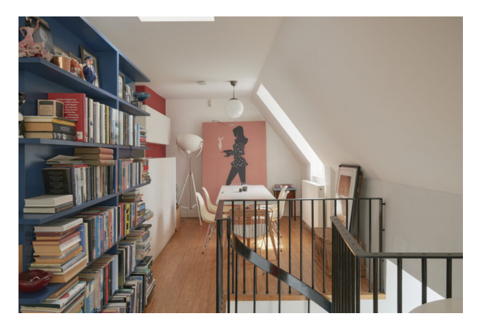
London, North London £1,300,000 Freehold