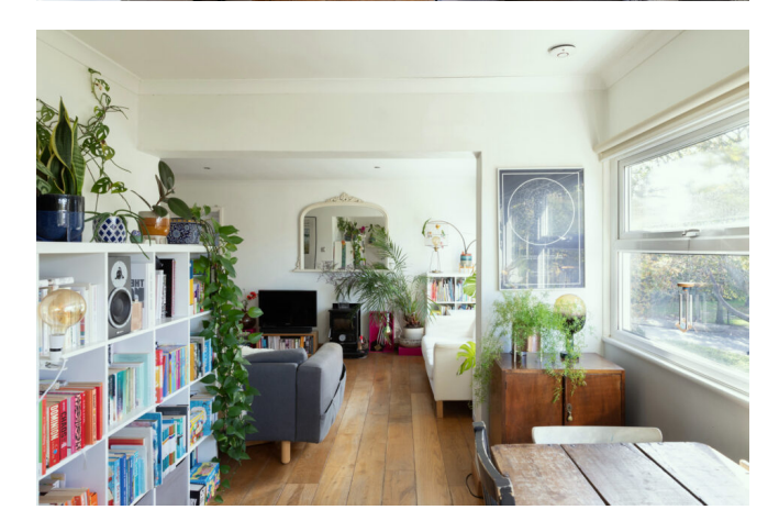
London, West London £535,000 Share of Freehold