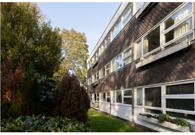
London, West London £535,000 Share of Freehold