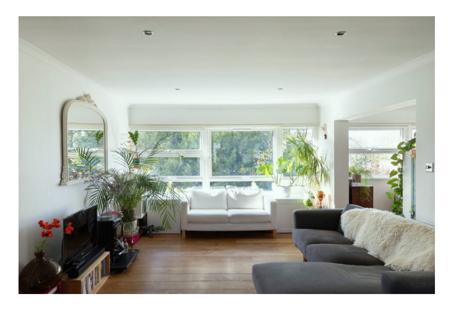
Spencer Road, London TW2 £535,000 Share of Freehold