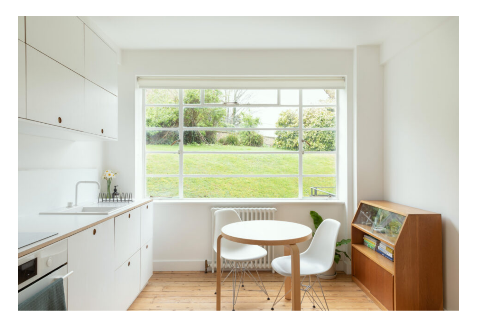
Taymount Rise, London SE23 Sold