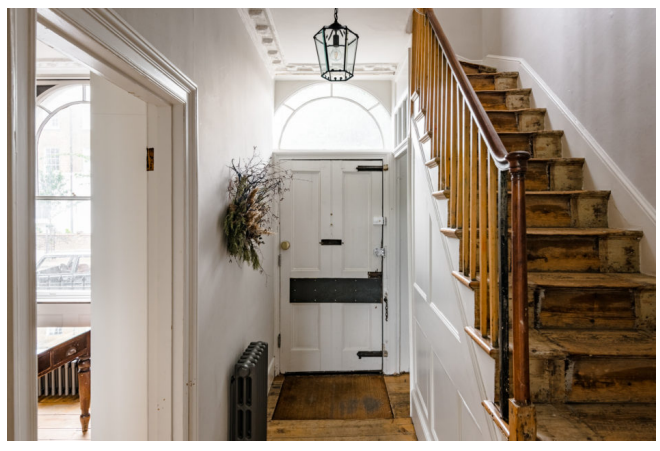
East London, London Sold