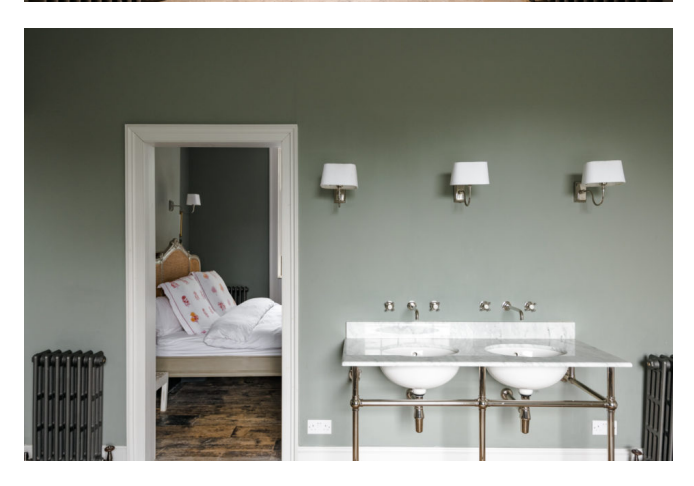
East London, London Sold