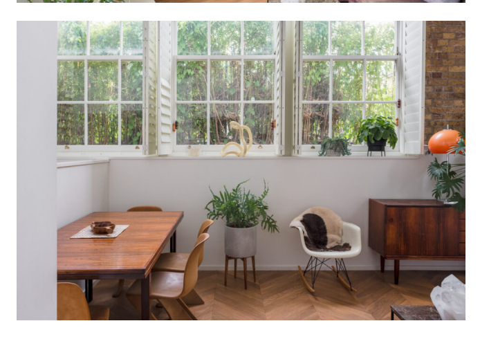
East London £860,000 Leasehold