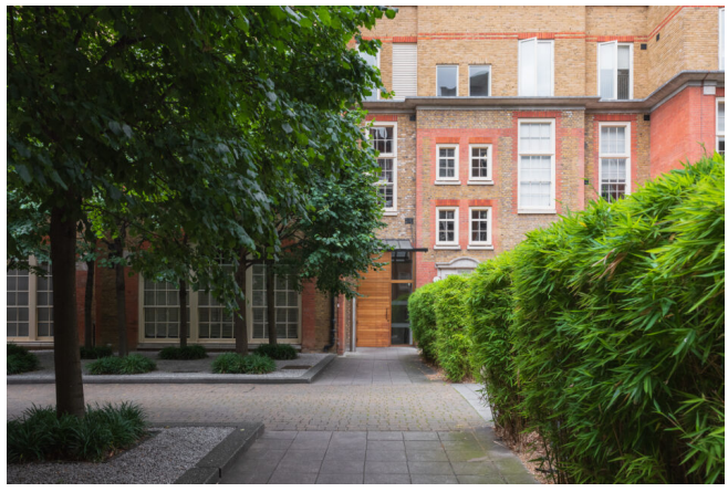
East London £860,000 Leasehold