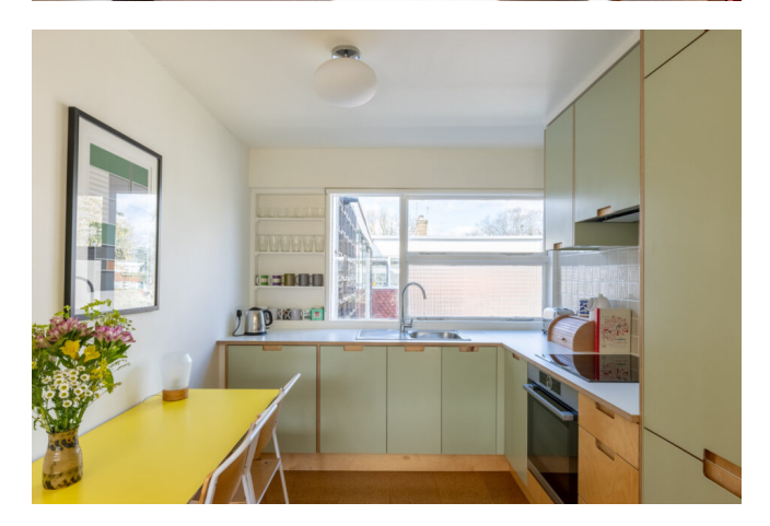
London, South London Sold