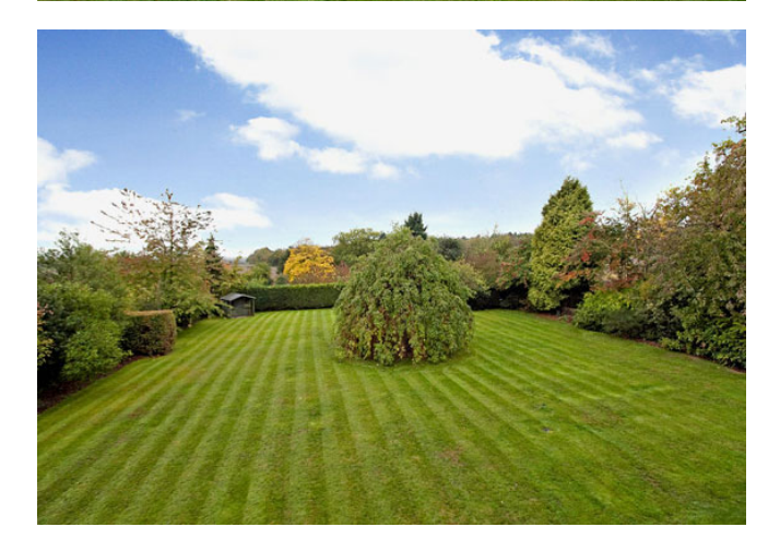
South-East England Sold