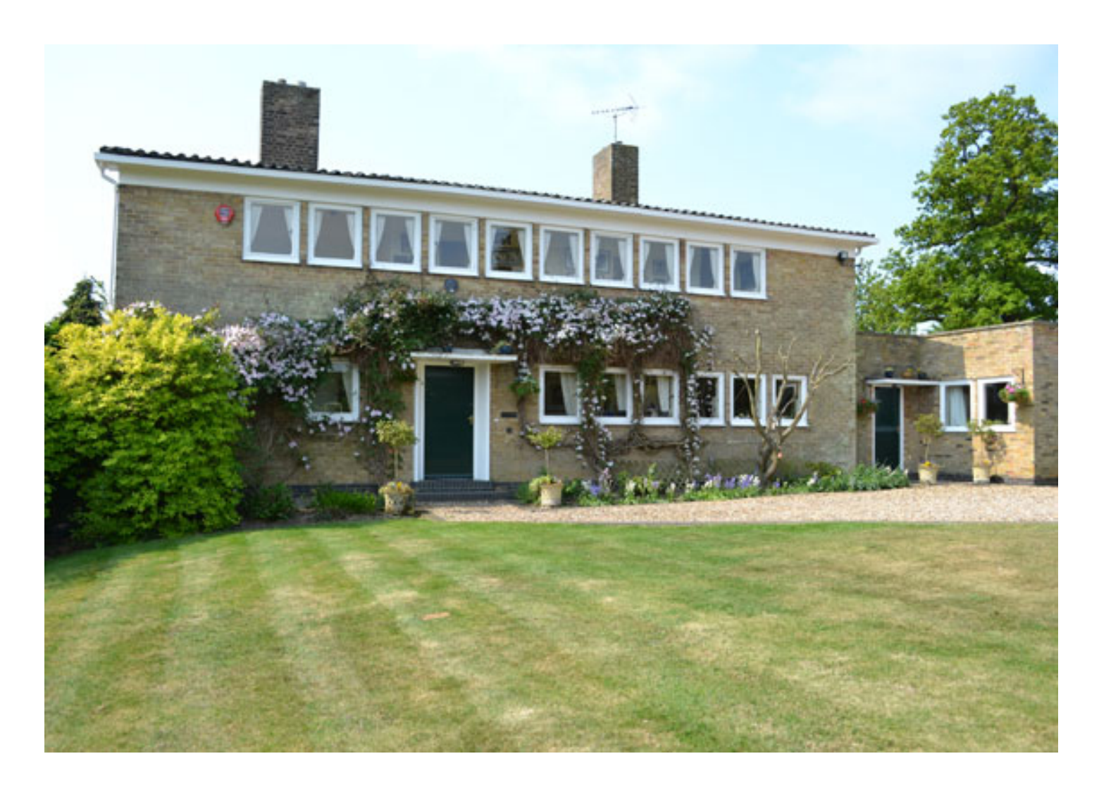
Tewin, Hertfordshire Sold