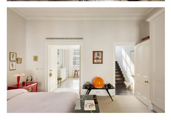
North London Sold