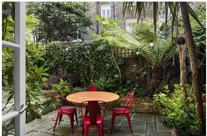
North London Sold