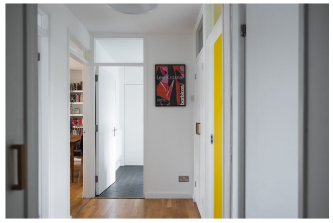
London, North London