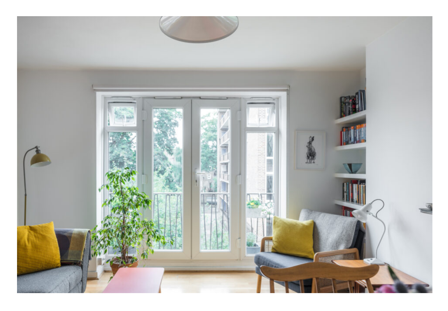
Clissold Crescent, London N16 Sold