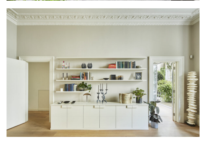
London, West London