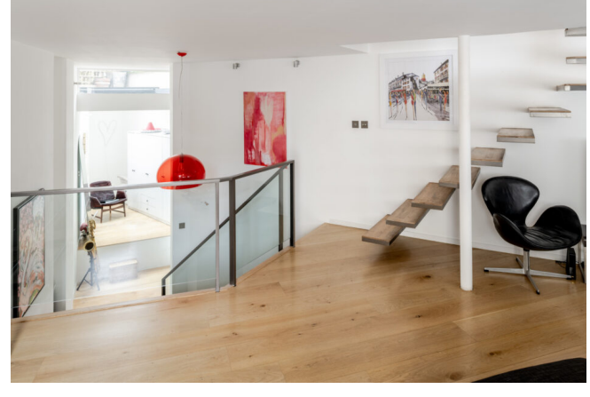
London, West London £2,250,000 Share of Freehold