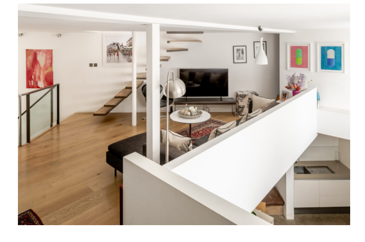
London, West London £2,250,000 Share of Freehold