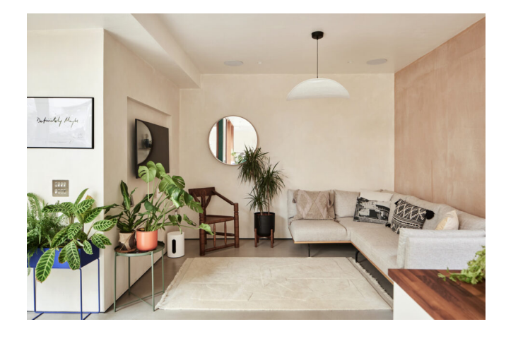
South-West England £750,000 Freehold