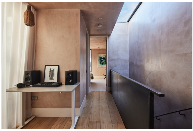
South-West England £750,000 Freehold