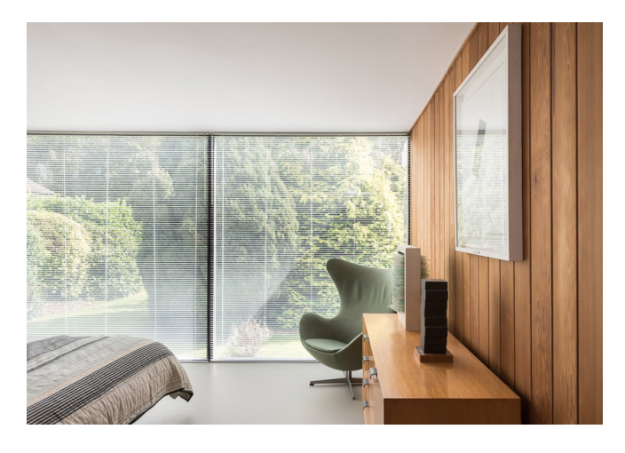
South-East England Sold