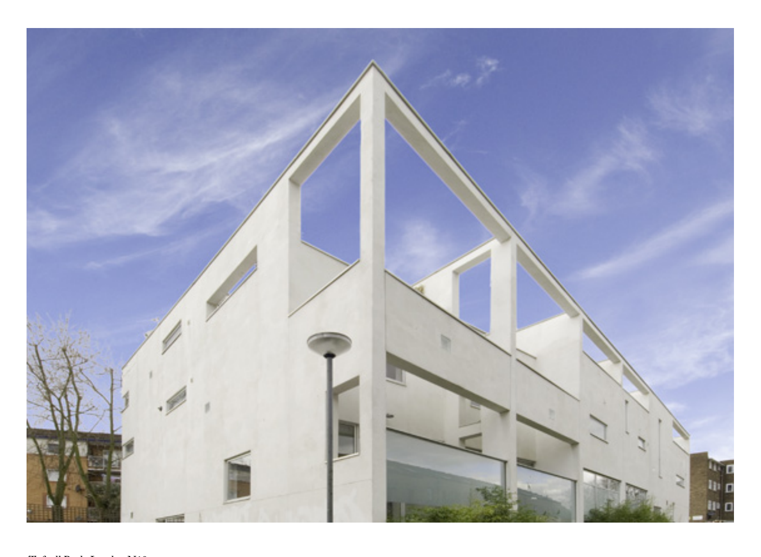
Tufnell Park, London N19 Sold