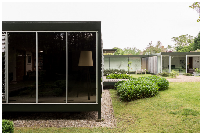
South-East England £1,600,000 Freehold