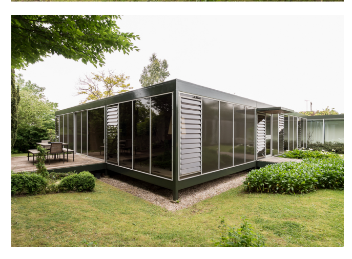
South-East England £1,600,000 Freehold