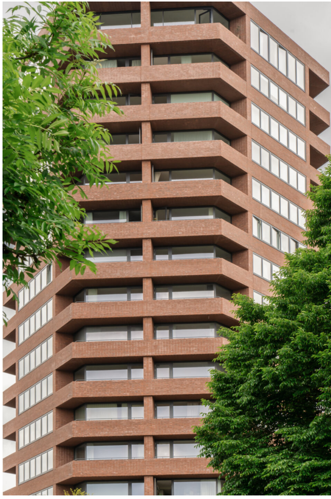
East London, London, North London Sold