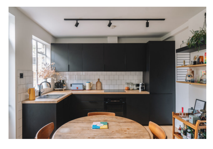
London, South London £600,000 Leasehold