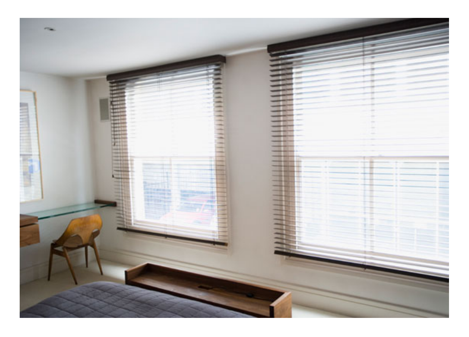
Bloomsbury, London WC1 Sold