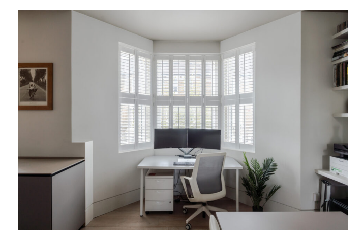
London, South London £550,000 Share of Freehold