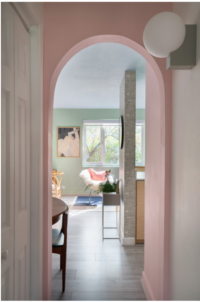
East London £350,000 Share of Freehold