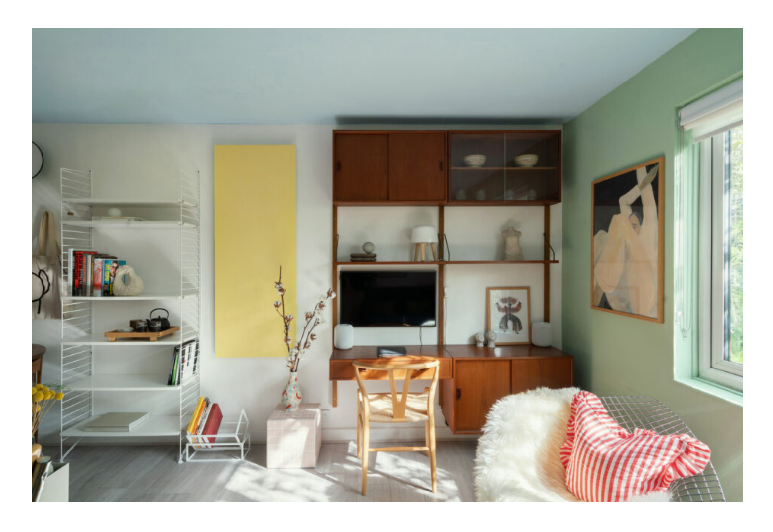
London E11 £350,000 Share of Freehold