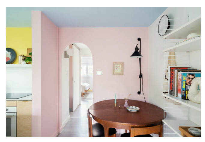
East London £350,000 Share of Freehold